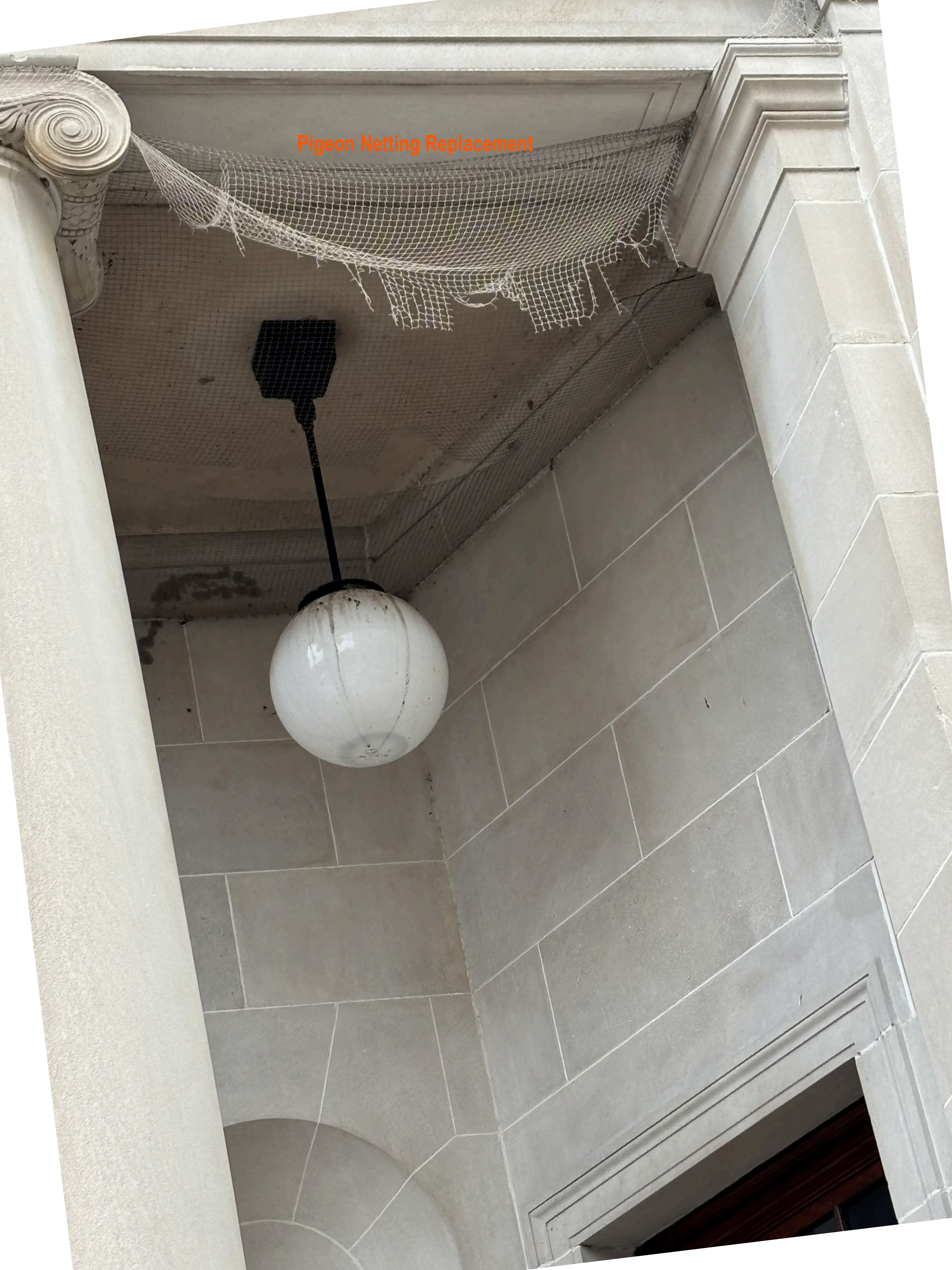
Pigeon Netting Replacement