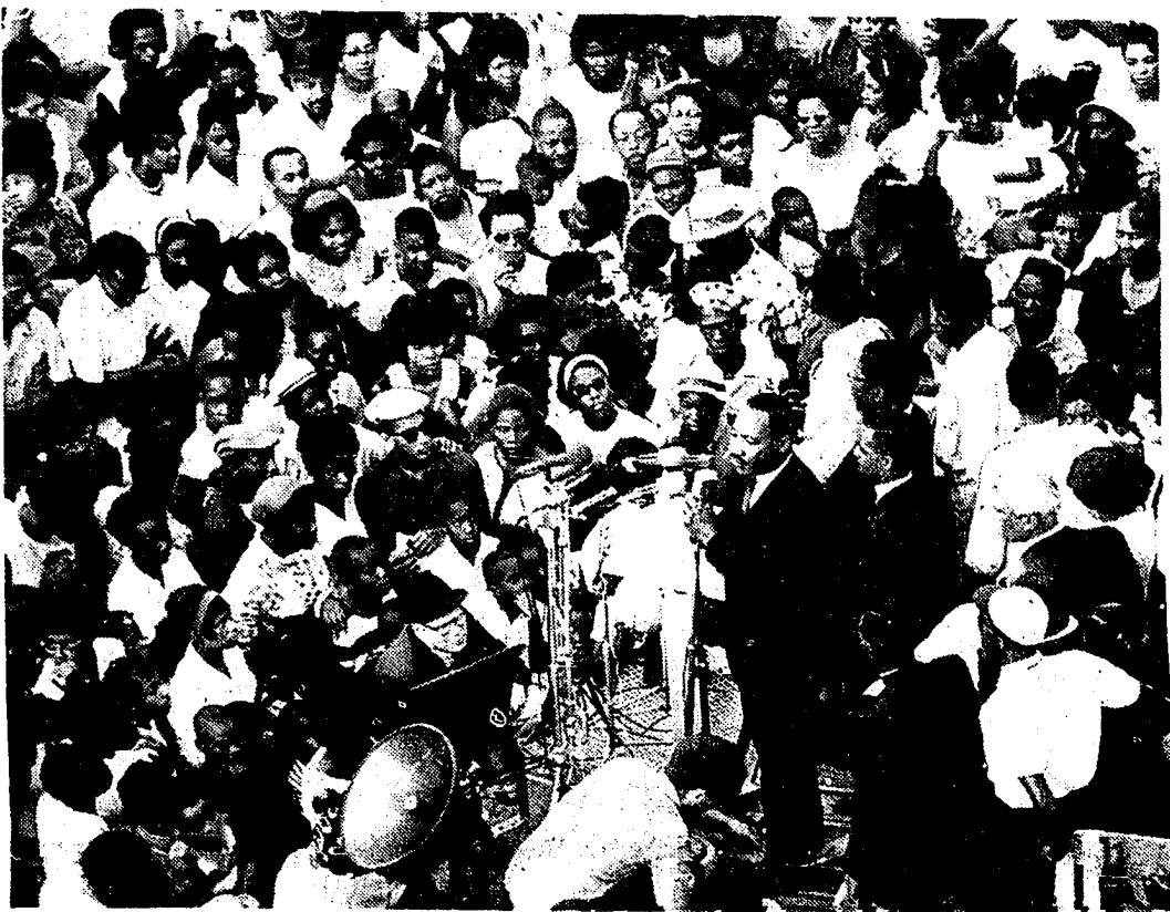
THEY LOVED HIM—Thousands of Washingtonians turned out at neighborhood rallies this week and cheered Martin